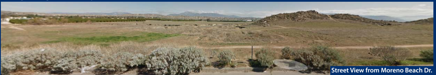
Street View from Moreno Beach Dr.